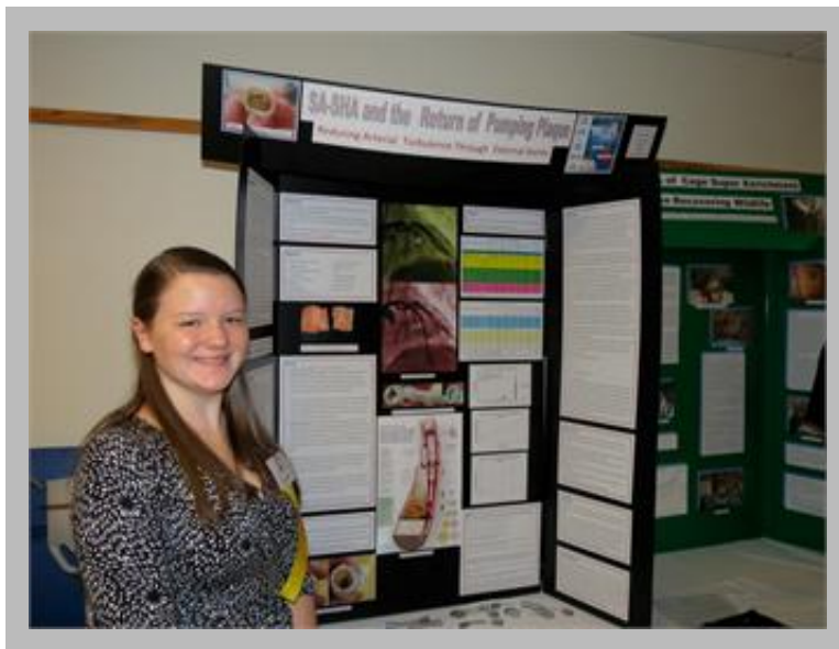
Grade 10, Lambrick Park High School